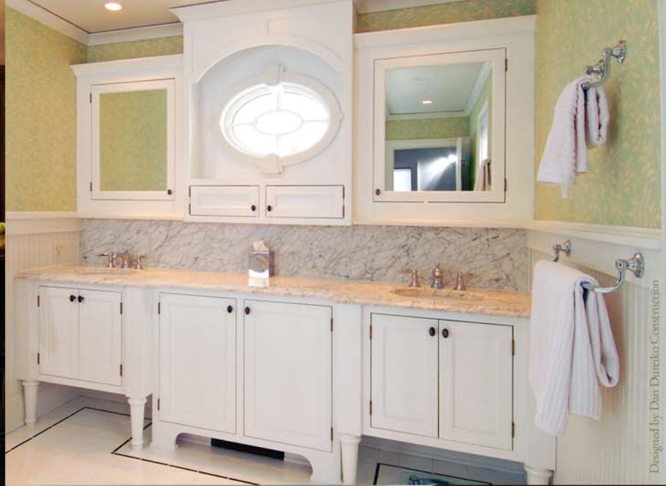
Designed by Dan Dureiko Construction